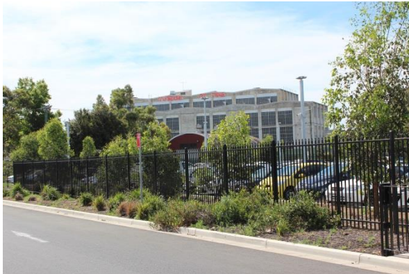
Museum entry from Penrith Train Station

We are open 9:30am to 4:30pm seven days a week. Excluding the following public holidays: Good Friday, Christmas Day, Boxing Day, and New Year.