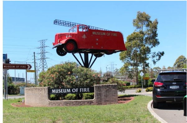
Museum entry from Mulgoa Road

By Road: From the M4 Motorway, take the Mulgoa Road (Rte14/73) exit towards Penrith, then follow Tourist Drive #14 north along Mulgoa Road & Castereagh Road. The entrance is located 1km north of the Panthers Entertainment Centre. The entrance is on the right, 50m north of the railway underpass bridge. The entrance can be easily identified by a 1942 Dennis Fire engine that is raised 4m off the ground!