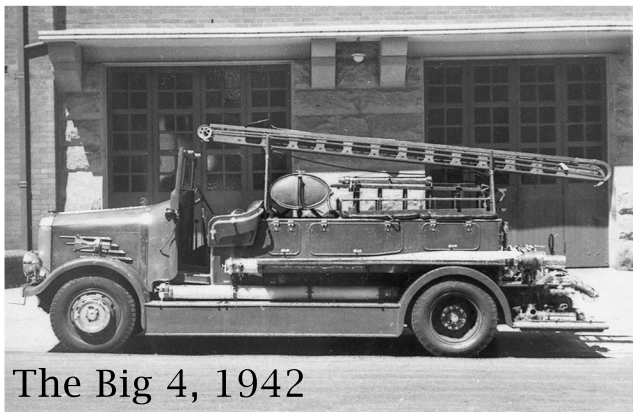
The Big 4, 1942

This fire engine is called the Dennis “Big 4”. We have one at the Museum of Fire which was used by firefighters between 1940 and 1968! Over its life, it was kept at the fire stations of Balmain (1940-1956), Marrickville (1956-1960), and Mascot (1960-1968).